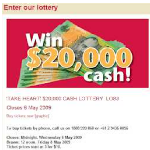
Content Managed via thankQ

thankQ BackOffice provides content management of the Raffles web site that enables information entered into the thankQ Raffles screens to be selectively published. This means the user is able to completely manage a Raffles calendar and associated booking / payment pages directly from thankQ.